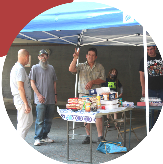
Pictured: (left) A donation bundle given by the Blue Star Mothers Chapter 1, Leominster to each Cathy's House resident, (right) MVOC's fourth of July resident BBQ