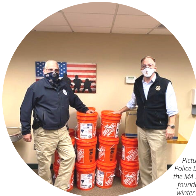
Pictured: Gardner Police Department and the MA Military Support foundation donating winter coats and face masks for MVOC veterans.

Case managers assist veterans in goal setting, employment, accessing education, and more.