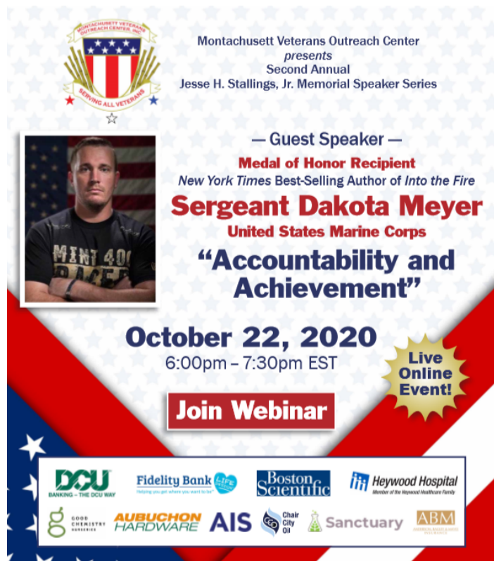
Pictured: MVOC's annual speaker series adapted to the remote environment, attracting over 250 attendees and over a dozen local sponsors.