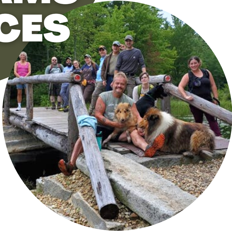
Pictured: (left) Veteran Care Kits provided by Catania Oils , (right) MVOC's Hike + Heal walkabout with North Quabbin Trails Association