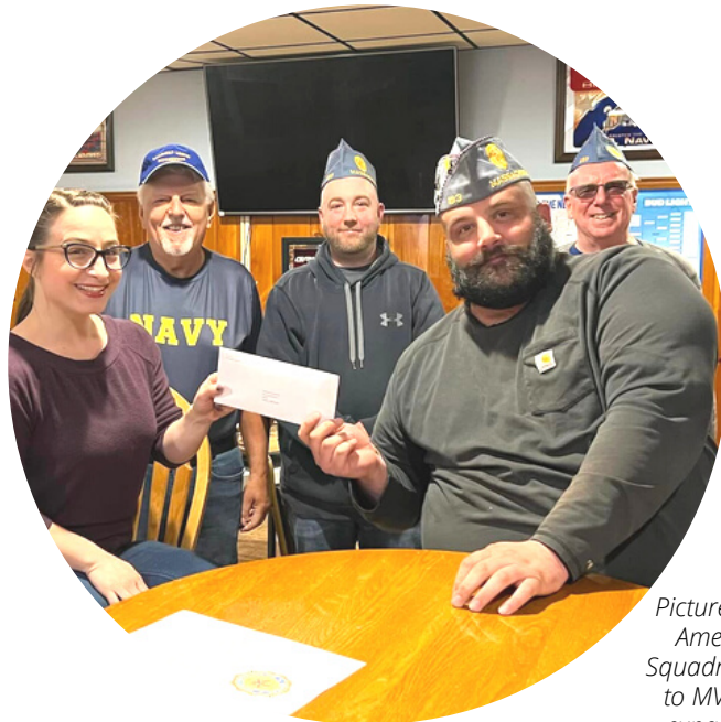
Pictured: Sons of the American Legion Squadron 193 donate to MVOC's housing expansion project.

Case managers assist veterans in goal setting, employment, accessing education, and more.