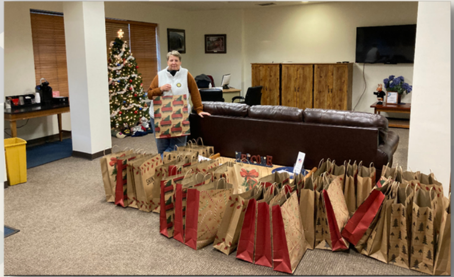
Pictured: Cornerstone Church donates holiday gift bags for MVOC veterans.