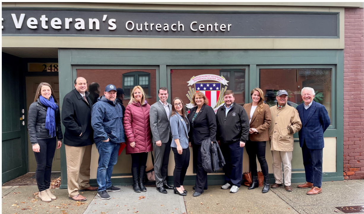
Pictured: MVOC hosts local officials and Dept. of Veteran Services staff for a tour and info session in December 2021