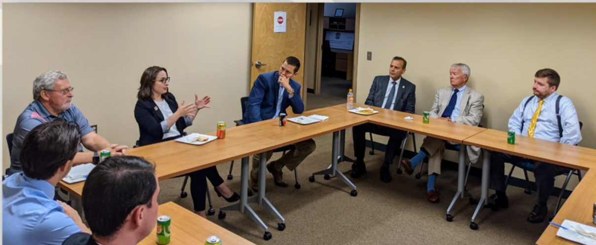
Pictured: MVOC hosts members of the Veterans Affairs Committee and local officials to discuss housing expansion plans and programming needs.