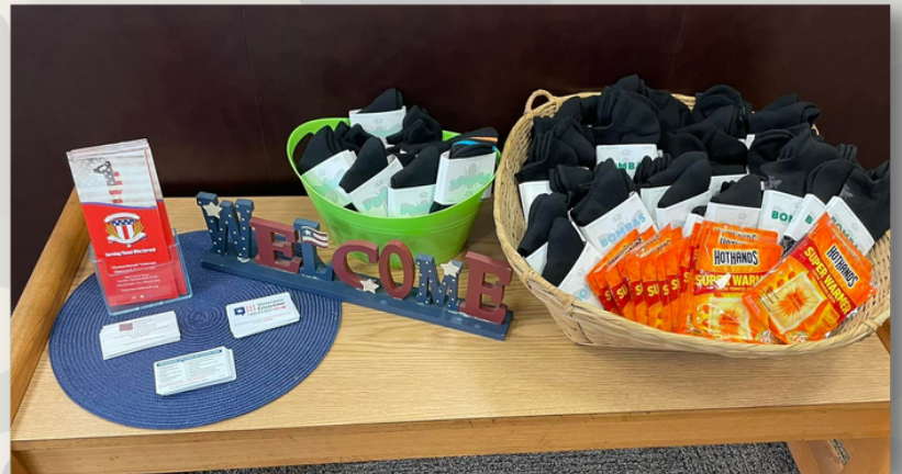
Pictured: Thanks to Bombas and local donors, MVOC handed out free socks and warming packs throughout the winter months.