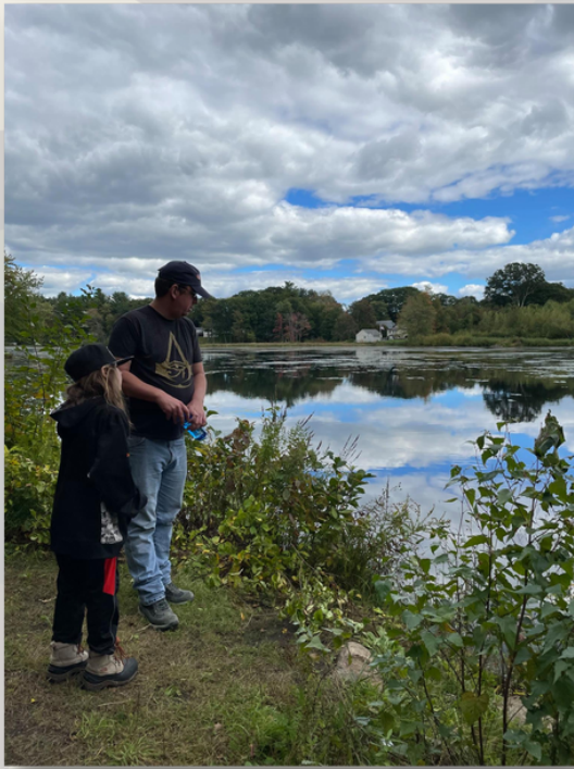
Pictured: An MVOC veteran and his son enjoy a guided walkabout hosted by MVOC.