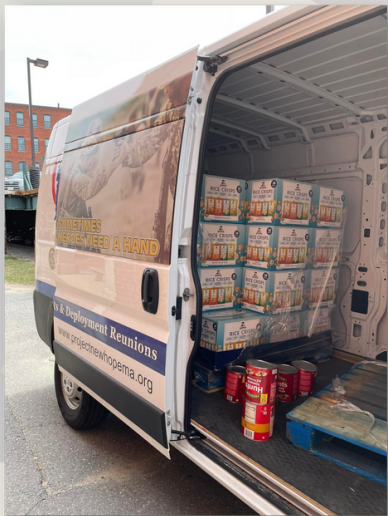
Pictured: Project New Hope donates surplus goods to the MVOC pantry.