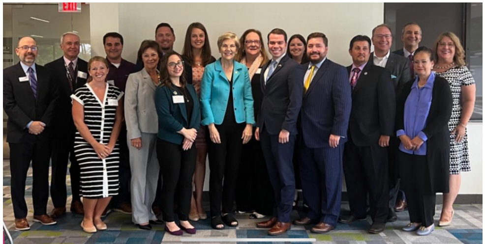
MVOC participated in a local meeting with US Senator Elizabeth Warren to discuss COVID impacts and statewide human service needs