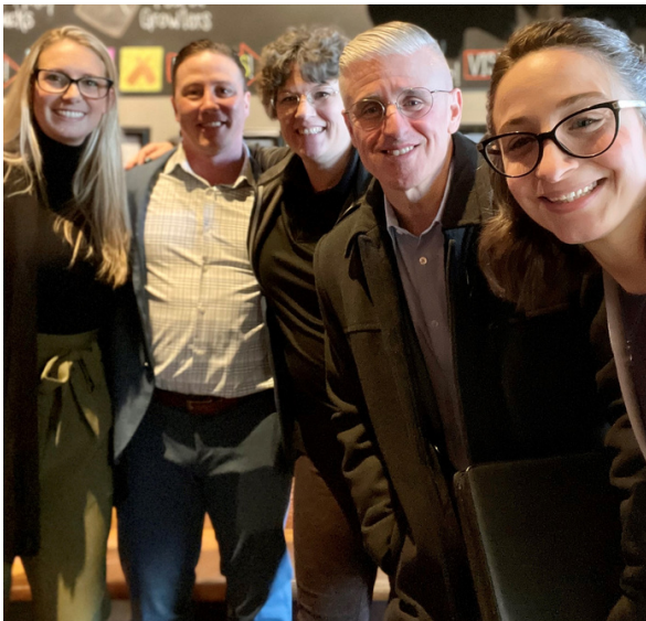
MVOC working closely with Mt. Wachusett Community College, Quinsigamond Community College, and the Medic Now Foundation