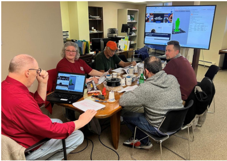
MVOC veterans in a 3D printing class with our neighbors at the Wachusett Business Incubator