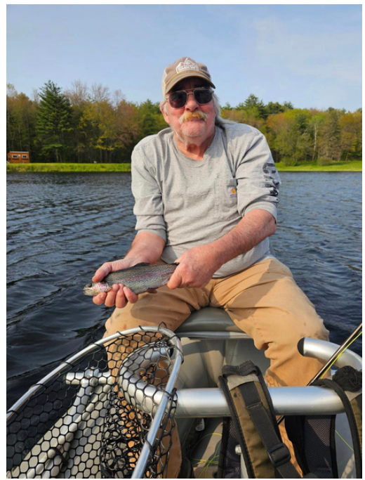
An MVOC resident enjoying a half day fishing trip