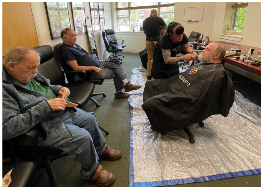
Local barbers offered on-site free haircuts for veterans for Memorial Day