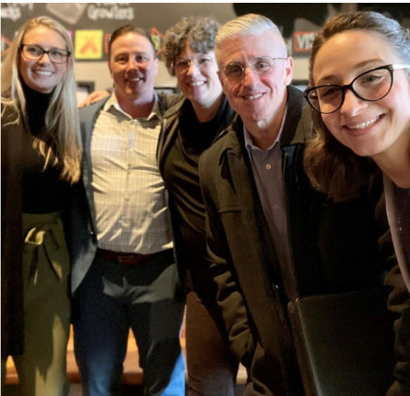
MVOC working closely with Mt. Wachusett Community College, Quinsigamond Community College, and the Medic Now Foundation