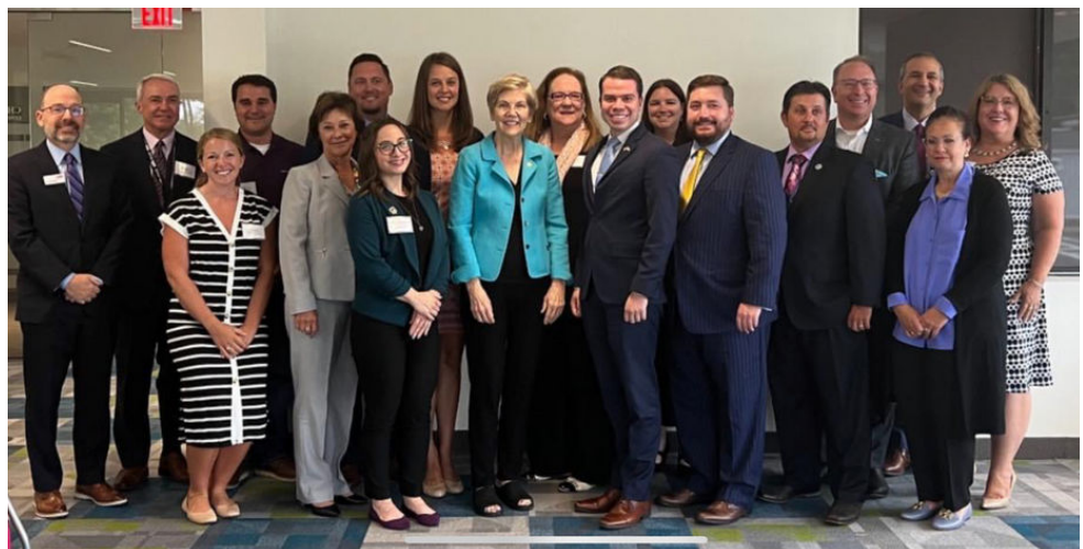
MVOC participated in a local meeting with US Senator Elizabeth Warren to discuss COVID impacts and statewide human service needs