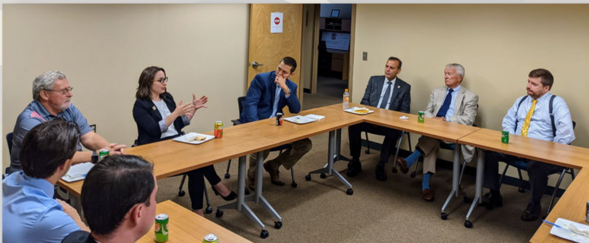
Pictured: MVOC hosts members of the Veterans Affairs Committee and local officials to discuss housing expansion plans and programming needs.