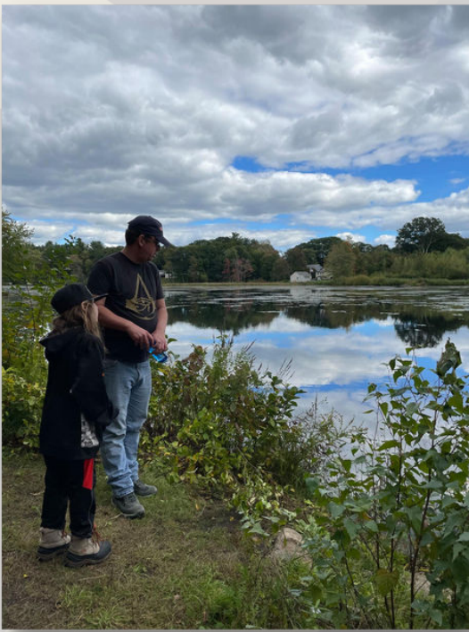
Pictured: An MVOC veteran and his son enjoy a guided walkabout hosted by MVOC.