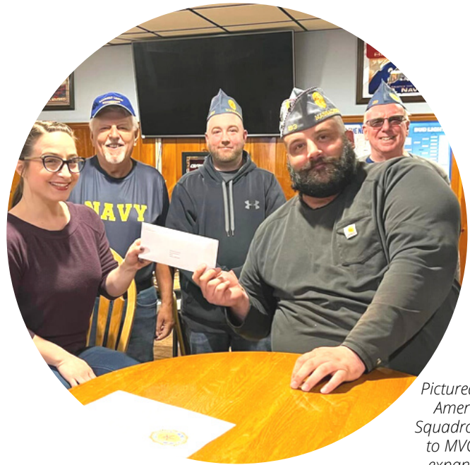
Pictured: Sons of the American Legion Squadron 193 donate to MVOC's housing expansion project.

Case managers assist veterans in goal setting, employment, accessing education, and more.