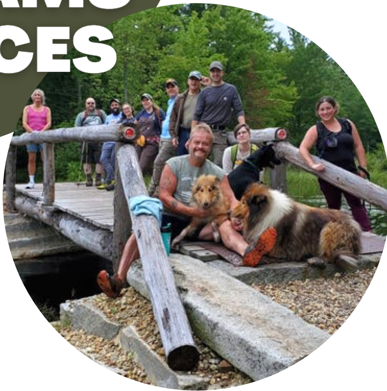
Pictured: (left) Veteran Care Kits provided by Catania Oils , (right) MVOC's Hike + Heal walkabout with North Quabbin Trails Association