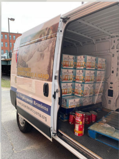
Pictured: Project New Hope donates surplus goods to the MVOC pantry.